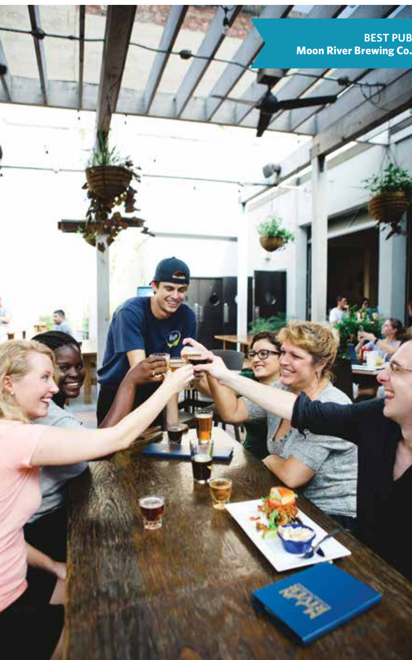
BEST PUB Moon River Brewing Co.