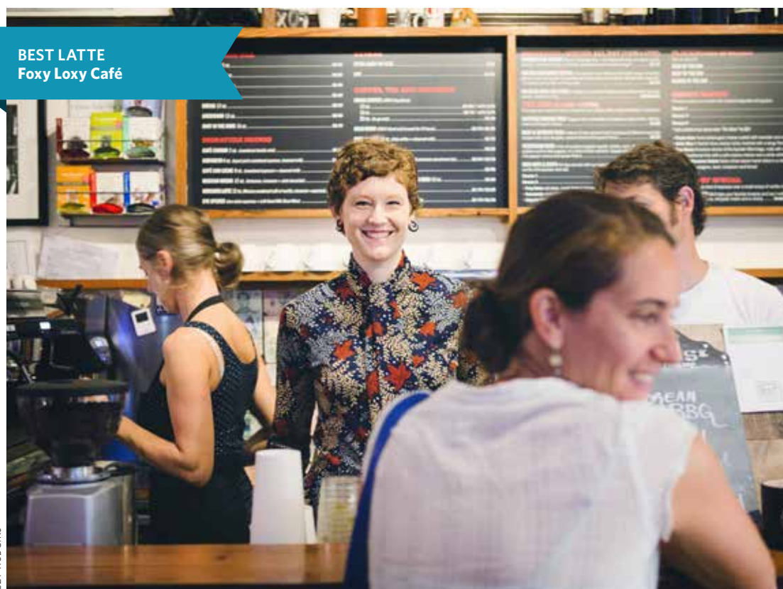
BEST LATTE Foxy Loxy Café

For frozen yogurt lovers, the pay-by-the-ounce concept is the best thing since, well, frozen