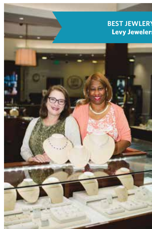
BEST JEWELRY Levy Jewelers