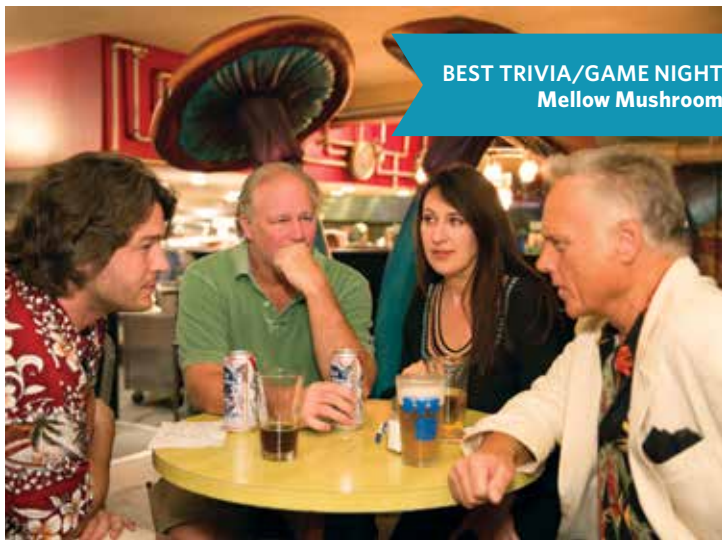
BEST TRIVIA/GAME NIGHT Mellow Mushroom