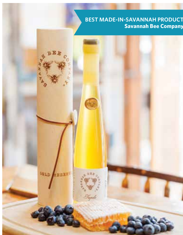
BEST MADE-IN-SAVANNAH PRODUCT Savannah Bee Company

Most people visit a nail salon with hopes of finding relaxation, sanitation and a skillful staff. The two Crystal Nails locations have that in spades. Customers also appreciate the quality OPI and Essie polishes. crystalnailsavannah.com Runner-up: La Bella Nails